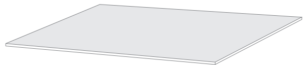
PLANCHE OU SUPPORT SOUPLE